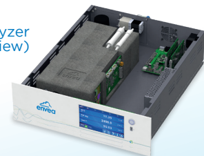
AF22e analyzer (internal view)